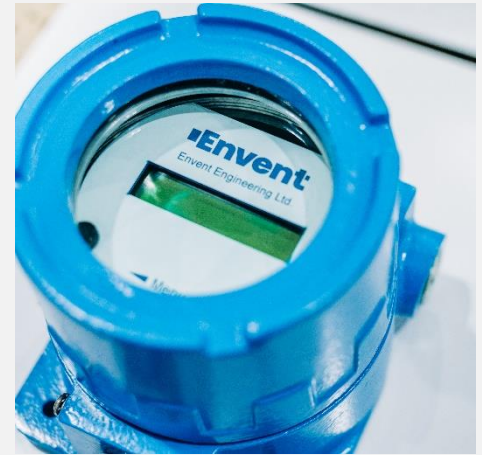
Envent M-Series housing