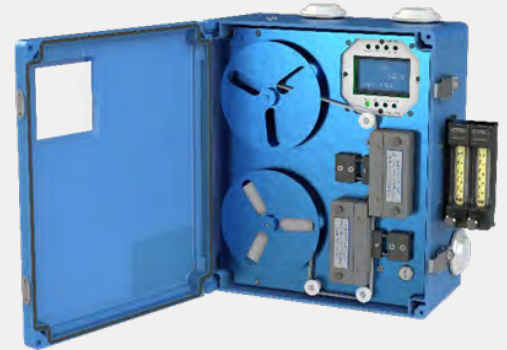
Envent Model 331SDS