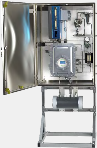
330SDS H 2 S and Total Sulfur Analyzer with Auto-Calibration in Stainless Steel Enclosure