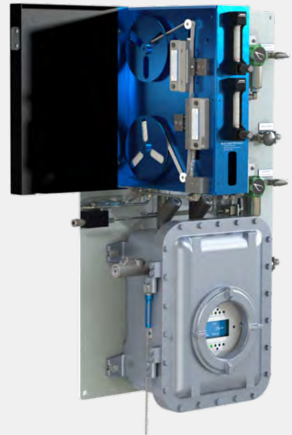
330SDS Standard Sample Conditioning System with Open Deck Lid